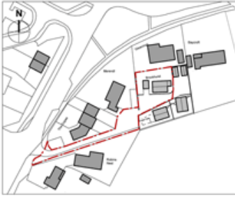
existing location plan scale 1-1250