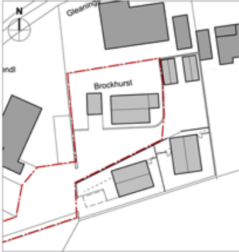
proposed block plan scale 1-500